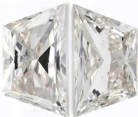
Matched Pair of Lab Grown Diamonds with a Total Weight of 1.48 ct(s)

*Comment: These man-made diamonds were grown in a laboratory and have the same chemical, physical, and optical properties as natural earth mined diamonds.