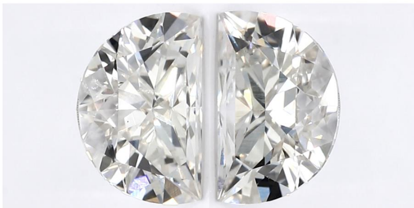
Matched Pair of Lab Grown Diamonds with a Total Weight of 1.00 ct(s)

*Comment: These man-made diamonds were grown in a laboratory and have the same chemical, physical, and optical properties as natural earth mined diamonds.