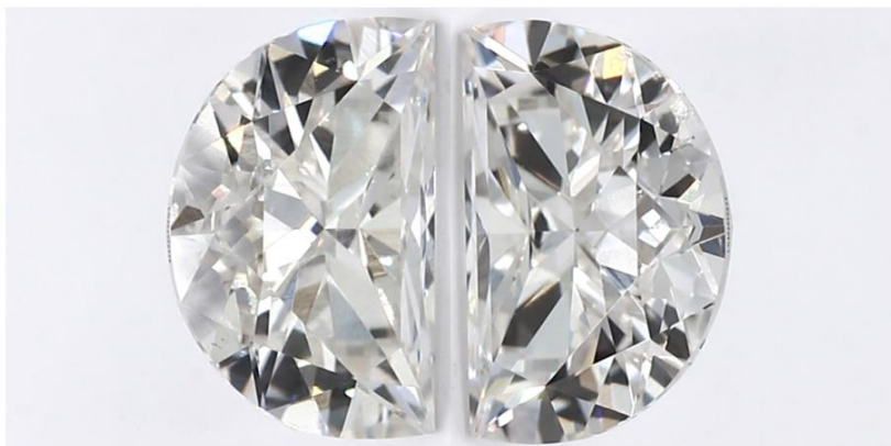
Matched Pair of Lab Grown Diamonds with a Total Weight of 1.07 ct(s)

*Comment: These man-made diamonds were grown in a laboratory and have the same chemical, physical, and optical properties as natural earth mined diamonds.