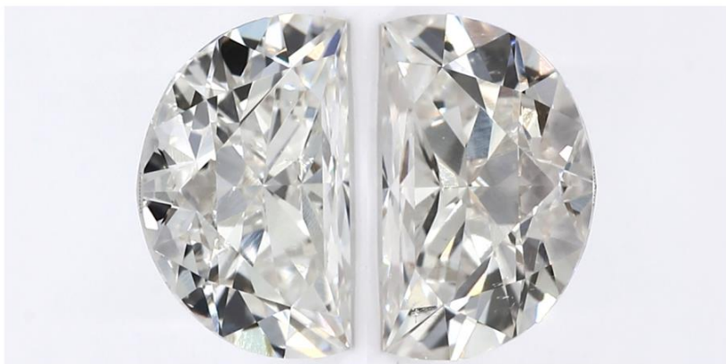
Matched Pair of Lab Grown Diamonds with a Total Weight of 1.44 ct(s)

*Comment: These man-made diamonds were grown in a laboratory and have the same chemical, physical, and optical properties as natural earth mined diamonds.