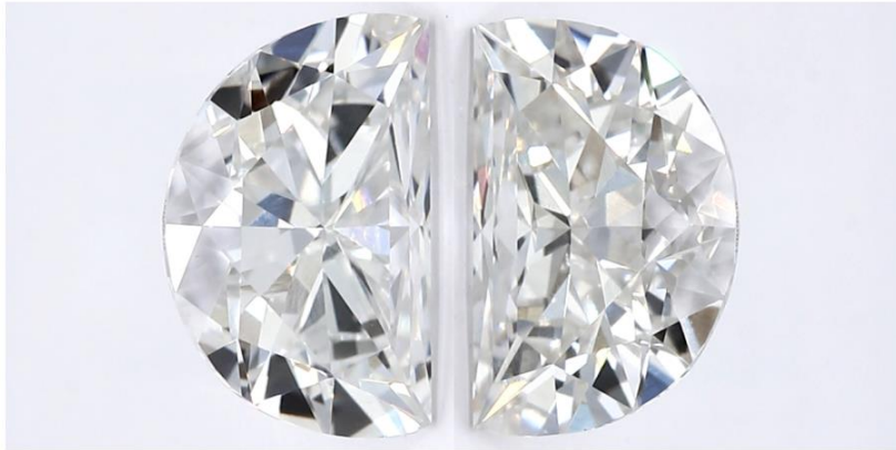
Matched Pair of Lab Grown Diamonds with a Total Weight of 1.41 ct(s)

*Comment: These man-made diamonds were grown in a laboratory and have the same chemical, physical, and optical properties as natural earth mined diamonds.