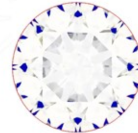
Optical Brilliance Excellent

Brilliance is the overall return of light to the viewer. The brilliance image is a representation of (a) white areas of light return, or brilliance, and (b) dark-blue areas of light loss.