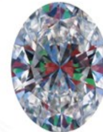
Optical Symmetry Good

The colored areas of the symmetry image are indications of light handling ability, giving a visual representation of proportions and facet alignment.