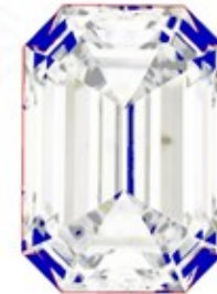
Optical Brilliance Excellent

Brilliance is the overall return of light to the viewer. The brilliance image is a representation of (a) white areas of light return, or brilliance, and (b) dark-blue areas of light loss.