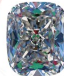
Optical Symmetry Very Good

The colored areas of the symmetry image are indications of light handling ability, giving a visual representation of proportions and facet alignment.