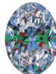
Optical Symmetry Very Good

The colored areas of the symmetry image are indications of light handling ability, giving a visual representation of proportions and facet alignment.