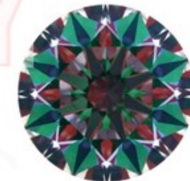
Optical Symmetry Excellent

The colored areas of the symmetry image are indications of light handling ability, giving a visual representation of proportions and facet alignment.