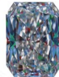
Optical Symmetry Very Good

The colored areas of the symmetry image are indications of light handling ability, giving a visual representation of proportions and facet alignment.