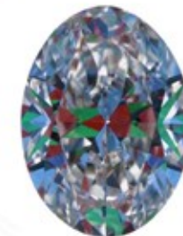
Optical Symmetry Good

The colored areas of the symmetry image are indications of light handling ability, giving a visual representation of proportions and facet alignment.