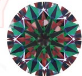
Optical Symmetry Excellent

The colored areas of the symmetry image are indications of light handling ability, giving a visual representation of proportions and facet alignment.