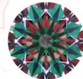
Optical Symmetry Excellent

The colored areas of the symmetry image are indications of light handling ability, giving a visual representation of proportions and facet alignment.