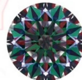
Optical Symmetry Excellent

The colored areas of the symmetry image are indications of light handling ability, giving a visual representation of proportions and facet alignment.