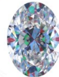
Optical Symmetry Good

The colored areas of the symmetry image are indications of light handling ability, giving a visual representation of proportions and facet alignment.