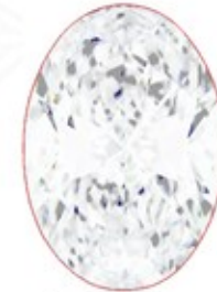
Optical Brilliance Excellent

Brilliance is the overall return of light to the viewer. The brilliance image is a representation of (a) white areas of light return, or brilliance, and (b) dark-blue areas of light loss.