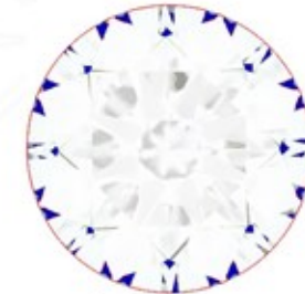
Optical Brilliance Excellent

Brilliance is the overall return of light to the viewer. The brilliance image is a representation of (a) white areas of light return, or brilliance, and (b) dark-blue areas of light loss.