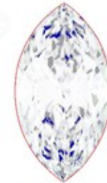
Optical Brilliance Excellent

Brilliance is the overall return of light to the viewer. The brilliance image is a representation of (a) white areas of light return, or brilliance, and (b) dark-blue areas of light loss.