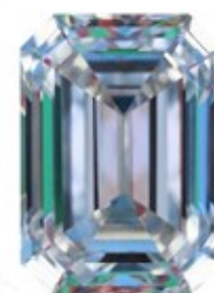
Optical Symmetry Good

The colored areas of the symmetry image are indications of light handling ability, giving a visual representation of proportions and facet alignment.