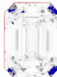
Optical Brilliance Excellent

Brilliance is the overall return of light to the viewer. The brilliance image is a representation of (a) white areas of light return, or brilliance, and (b) dark-blue areas of light loss.