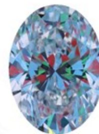
Optical Symmetry Good

The colored areas of the symmetry image are indications of light handling ability, giving a visual representation of proportions and facet alignment.