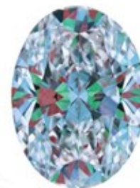
Optical Symmetry Good

The colored areas of the symmetry image are indications of light handling ability, giving a visual representation of proportions and facet alignment.