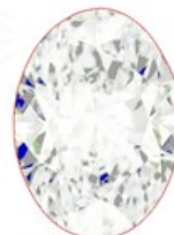
Optical Brilliance Excellent

Brilliance is the overall return of light to the viewer. The brilliance image is a representation of (a) white areas of light return, or brilliance, and (b) dark-blue areas of light loss.