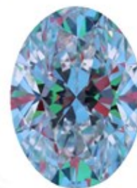
Optical Symmetry Good

The colored areas of the symmetry image are indications of light handling ability, giving a visual representation of proportions and facet alignment.