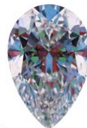
Optical Symmetry Very Good

The colored areas of the symmetry image are indications of light handling ability, giving a visual representation of proportions and facet alignment.