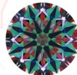
Optical Symmetry Excellent

The colored areas of the symmetry image are indications of light handling ability, giving a visual representation of proportions and facet alignment.