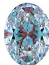
Optical Symmetry Very Good

The colored areas of the symmetry image are indications of light handling ability, giving a visual representation of proportions and facet alignment.