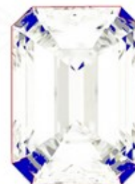
Optical Brilliance Excellent

Brilliance is the overall return of light to the viewer. The brilliance image is a representation of (a) white areas of light return, or brilliance, and (b) dark-blue areas of light loss.