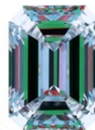
Optical Symmetry Very Good

The colored areas of the symmetry image are indications of light handling ability, giving a visual representation of proportions and facet alignment.