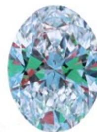
Optical Symmetry Good

The colored areas of the symmetry image are indications of light handling ability, giving a visual representation of proportions and facet alignment.