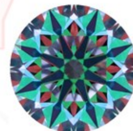
Optical Symmetry Excellent

The colored areas of the symmetry image are indications of light handling ability, giving a visual representation of proportions and facet alignment.