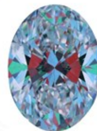
Optical Symmetry Very Good

The colored areas of the symmetry image are indications of light handling ability, giving a visual representation of proportions and facet alignment.