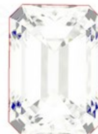
Optical Brilliance Excellent

Brilliance is the overall return of light to the viewer. The brilliance image is a representation of (a) white areas of light return, or brilliance, and (b) dark-blue areas of light loss.